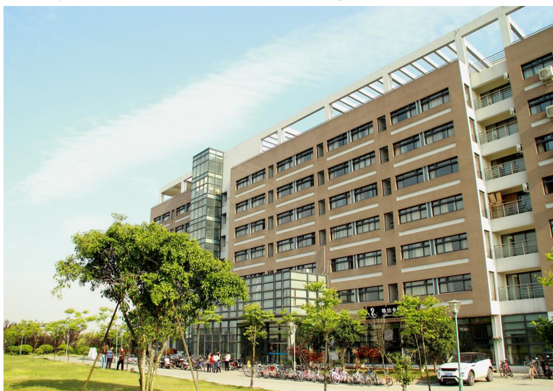
The International Students Dormitory of ZJNU

conditioner, water heater and so on. Each floor has a general kitchen and laundry room. The kitchen facilities include refrigerator and kitchen utensils. There is also a fitness room which is free for international students. In order to provide a conducive learning environment for the international students, the school opened several cafés. In addition, there is a Muslim restaurant on the third floor of the Taoyuan dining hall for students who need such services. On the other hand, with the school's all-in-one card, international students can use the library and other facilities free of charge.