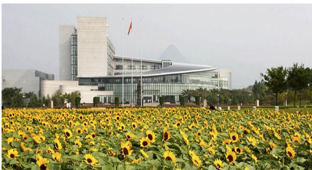
The Library of ZJNU

between China and the recipient countries, the Ministry of Commerce of People's Republic of China will continuously intensify efforts in enlarging the enrollment scale and improving the quality of education. We believe that by going through the programs and obtaining relevant qualifications, beneficiaries are put in a better stead to embrace a successful career and brighter future.