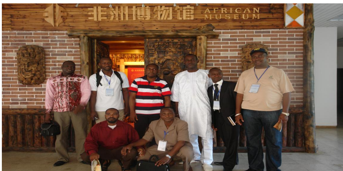
The African Museum of ZJNU

Students completing the prescribed credits and dissertation, passing oral defense will be awarded a master's degree by the academic degree evaluation committee in the university.